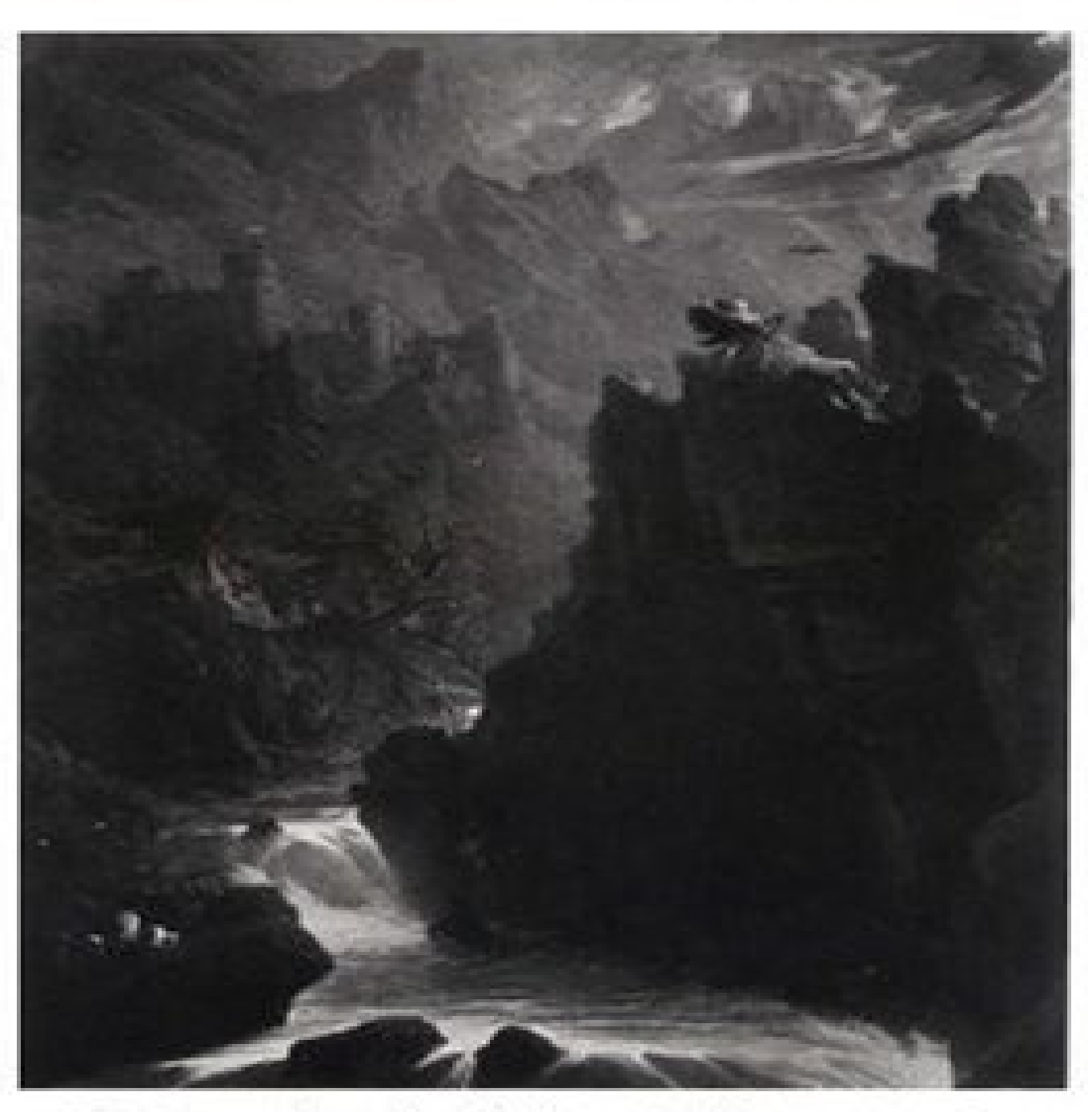
"The finest modern study of the Romantic achievement, its origins and evolution both in theory and practice."